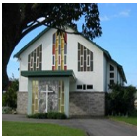
St. Peter Chanel