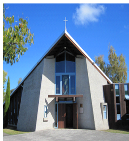
Our Lady of Lourdes